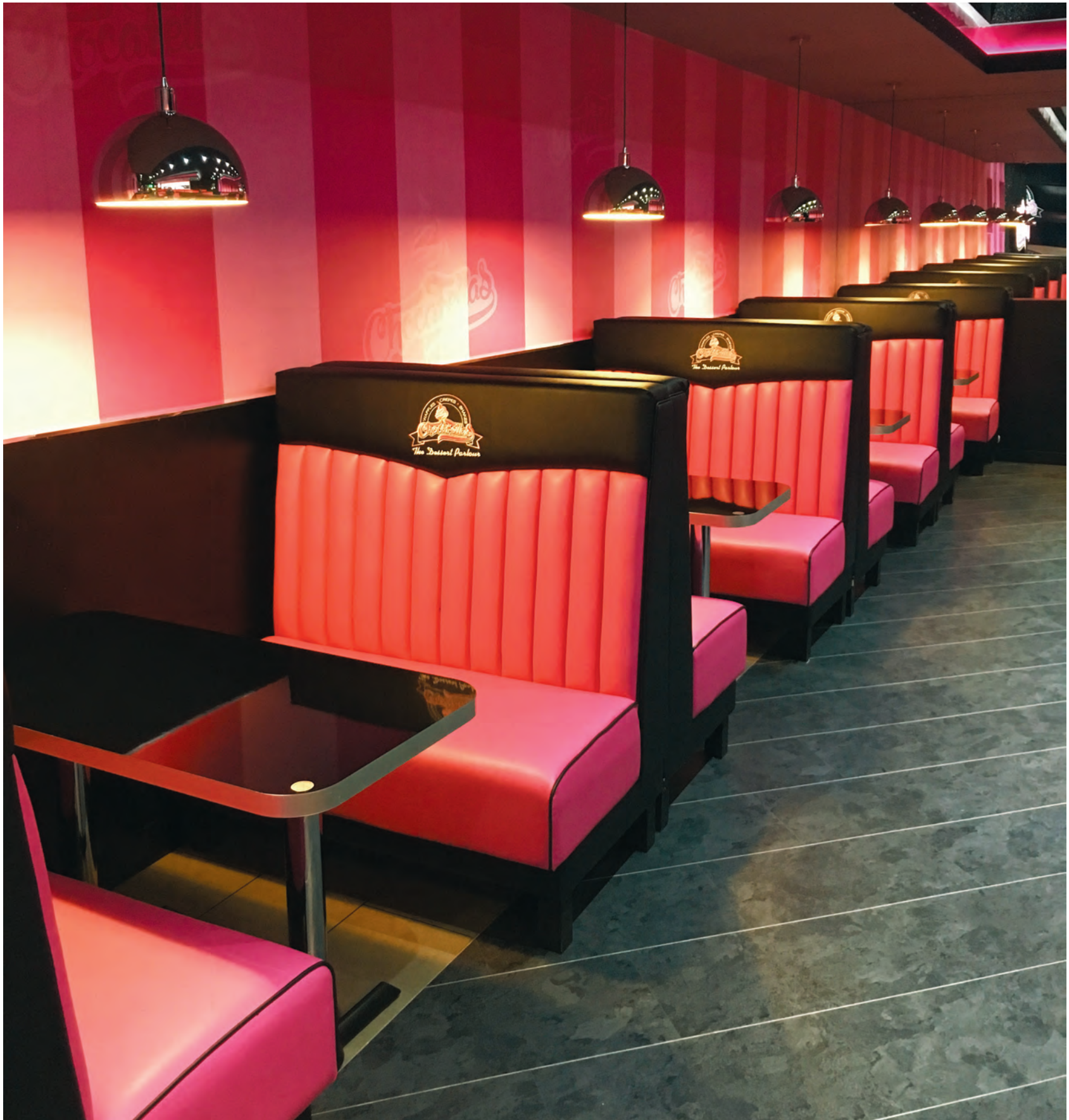
Table tops HPL

Completed projects Chatham, The United Kingdom