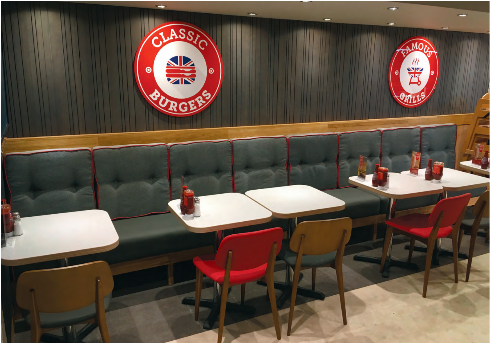
Table tops / wall panels HPL / natural ash wood

Completed projects Felixstowe, The United Kingdom